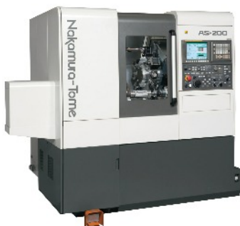
NAKAMURA AS200 AY - FITTED WITH A HALTER ASSIST LOAD ROBOT

Single Turret Milling Turning Centre, Linear Guideways on all axes, +/- 41 mm Y-axis, 15/11 kW spindle motor, Spindle speed 4500 min -1 , Driven-tool speed 6000 min -1 , Faster rapid traverse 24 m/min for the X-axis, and 36 m/min for the Z-axis. Bar capacity 65 mm standard. 8" Chuck, 5 station turret, Gearless Direct Belt Driven tools