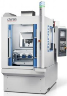
CHIRON FZ12 KW

This machine incorporates twin pallets with rotary trunnions, a Microlock work holding system, Renishaw probing system, 48 tool magazine, high pressure coolant and a 15,000 rpm spindle.