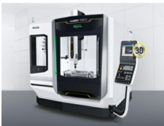
ECO MILL 1100V

High speed with 4 th Axis. This Machining centre can accommodate work pieces up to 1000 kg, eco Mill 1100 V with the traverse X-axis of 1100 mm, fitted with halter assist load robot