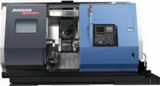
DOOSAN MX 2000

This machine has a maximum bar diameter of 400mm, a 10KW milling spindle, 42 position tool changer and runs at 10,000 rpm with bar feed.